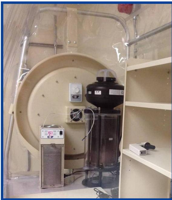
Dehumidifier in a vinyl Anaerobic Chamber with HSRC and Fan Box