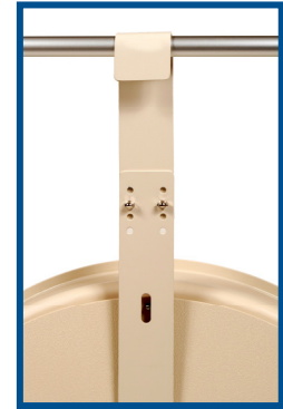
Hanger pole include for mounting with Dehumidifier

The unique mounting system allows it to fit into the same space of the standard equipment entry port of the COY Vinyl Glove Boxes. With support from the Glove Boxes Aluminum Frame the adjustable clamps and taped seal make the COY Large Capacity Dehumidifier easy to add on to any existing system or install on a new system while still allowing access the to the glove box interior.